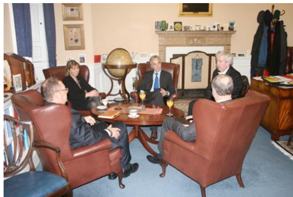
Meeting the Principal