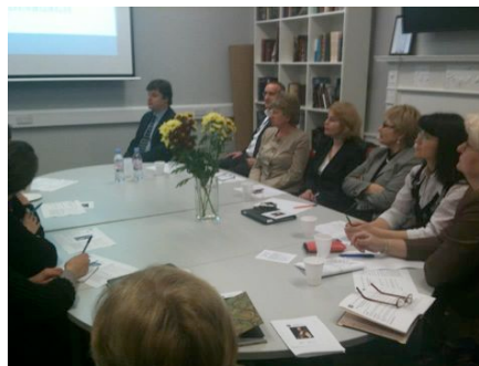
Library Knowledge Exchange event