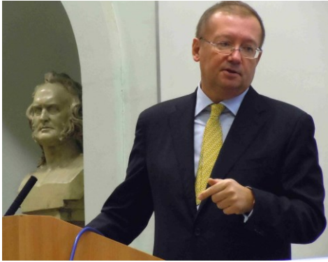
Ambassador to Great Britain Dr Alexander Yakovenko

The 28 th of November the University of Edinburgh hosted the Russian Ambassador to Great Britain Dr Alexander Yakovenko. In the Old College the Ambassador gave a Montague Burton Lecture 'Russia's View of the World and Foreign Policy' and answered questions on the international relations.