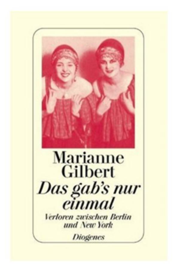
Figure 1: Front covers of Memories of a Mischling and Das gab's nur einmal

In the German translation, however, narratives other than the personal are more prominent in the peritexts. The German title Das gab's nur einmal (literally 'that there was only once') does not provide a self-reference by the author. The German title actually refers to the hit song Das gibt's nur einmal (translated into English as 'Just once for all time')[4] for which Robert Gilbert, the author's father and a famous lyricist of his time, wrote the lyrics. The frame of personal memories of the original is explicitly depersonalized linguistically in the translation by the use of the neuter definite article das (that), which cannot grammatically refer to a person but only to an object or event. The term 'Mischling' is not retained. The German meta-narrative of coming to terms with a Nazi past, in the sense of an anti-fascist education and a self-critical historical awareness among the population makes the use of Nazi terms unacceptable.