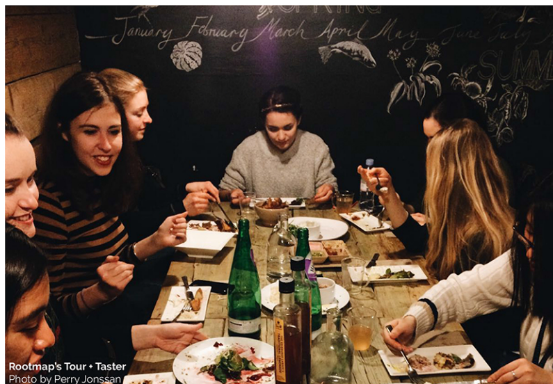
Rootmap's Tour + Taster