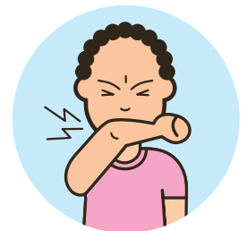
Continuous or persistent cough