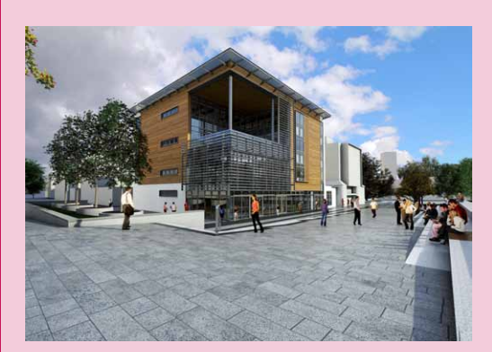
Figure 2.4: The King's Buildings Library