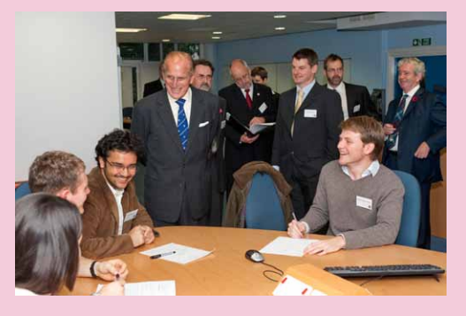
Figure 2.1: Opening of the Learning and Teaching Cluster