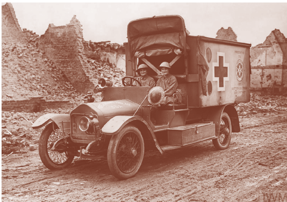
Elsie Knocker (driving) and Mairi Chisholm, known as 'the Madonnas of Pervyse', driving their motor ambulance through the ruins of Pervyse, July 1917. The two women manned a first aid post in the Belgian front line for most of the war.