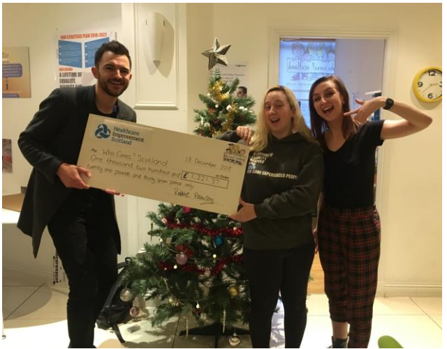
Our corporate parenting lead handing over a big cheque to WC?S