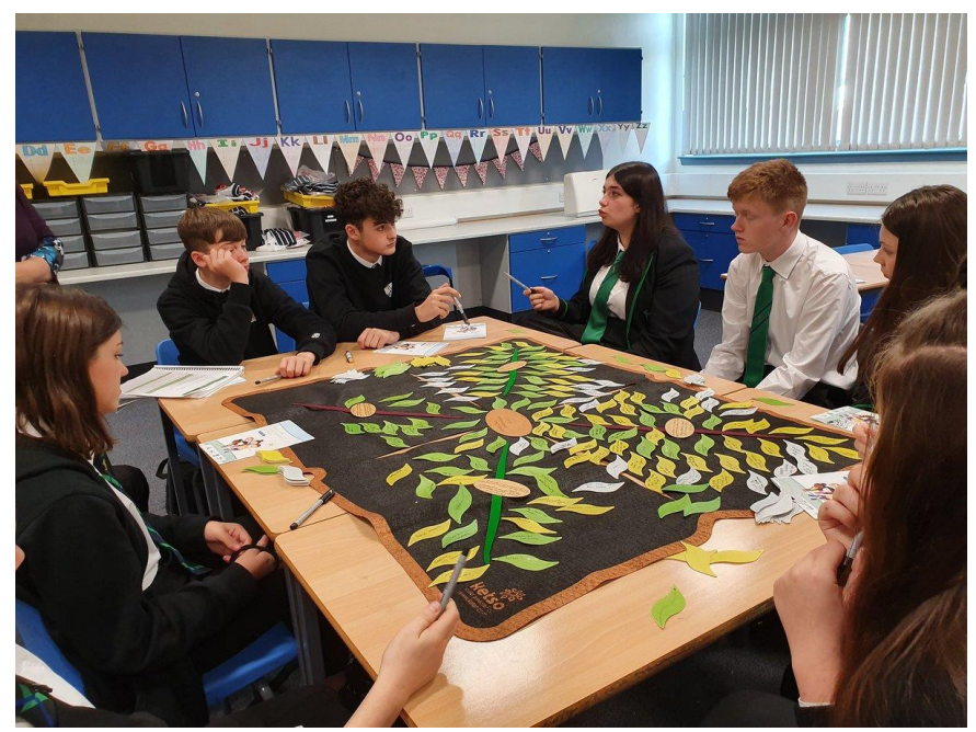
Young people from St. Paul's Academy exploring weight issues by using the Ketso tool

steps to be taken by all partners, including the NHS, local authorities, health and social care partnerships, the third sector, and the community.