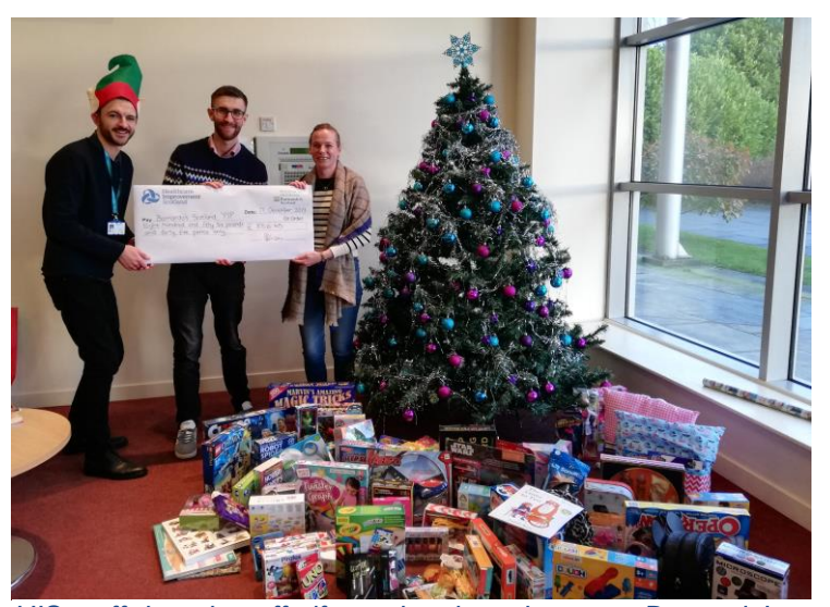
HIS staff dropping off gifts and a giant cheque to Barnardo's Youth Involvement Project