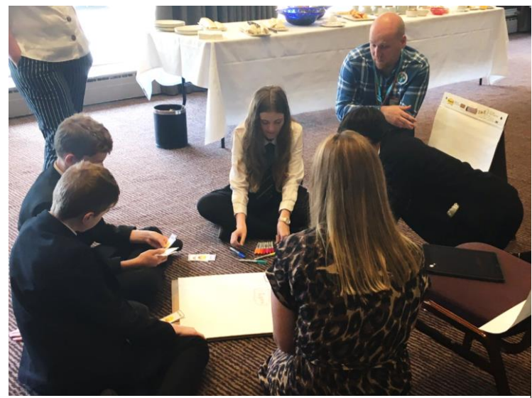
Young people from East Renfrewshire schools sharing their views