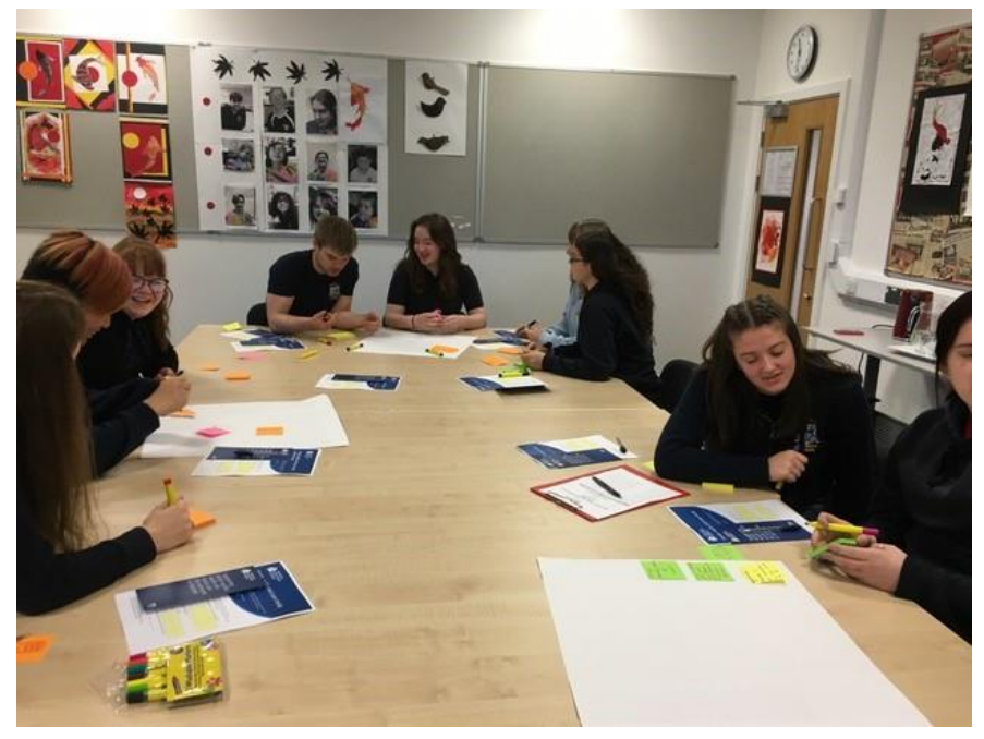
Young people from Kirkwall Grammar School discussing shared decision-making