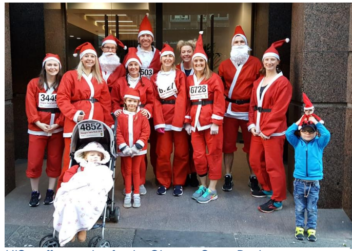
HIS staff preparing for the Glasgow Santa Dash

In December 2019 we raised money and collected gifts for Barnardo's Scotland's Kidsmas appeal. Again, we participated in the Glasgow Santa Dash and held a raffle to generate donations. We received over £900 in donations and around 80 gifts. These donations went to the Youth Involvement Project, which supports children and young people with experience of parental substance use in the Easterhouse area. Many of these young people have experience of the care system or are more likely to enter the care system.