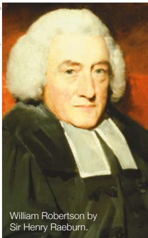
William Robertson by Sir Henry Raeburn.