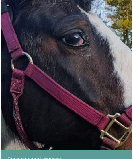
The horse back at home

This horse spent around 2 weeks with us, before removal of the SPL and discharge. Aside from a small corneal scar you can see no ill effects