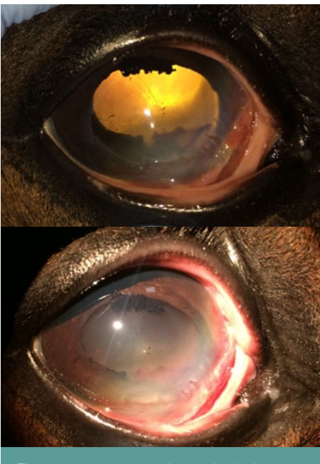
The eye post-surgery, showing a reduction in inflammation and a large dilated pupil and reducing oedema

In cases such as these, the surgery is the easy part with the aftercare perhaps the most critical part of the treatment. A subpalpebral lavage system (SPL) was placed and the eye treated with atropine, antimicrobials, plasma and EDTA and the horse systemically with NSAIDs.