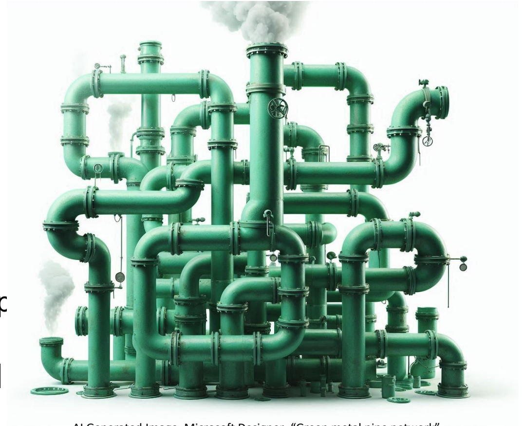
AI Generated Image .Microsoft Designer. "Green metal pipe network"