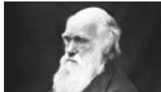
Charles Darwin Naturalist and author of On the Origin of Species .

From scientific geniuses to sporting heroes our alumni and staff are high achievers who make a difference.