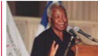
Julius Nyerere First Prime Minister and later President of Tanzania.