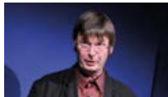
Ian Rankin World-famous author and creator of John Rebus, the cynical detective hero of his bestselling crime fiction novels.