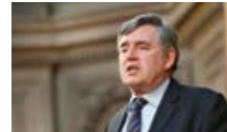
Gordon Brown One of three UK Prime Ministers associated with the University.