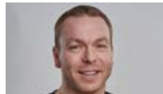
Sir Chris Hoy Hugely successful cyclist and winner of seven Olympic medals (six gold and one silver).