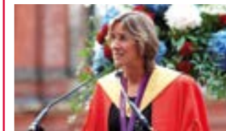
Katherine Grainger Great Britain's most successful female rower and winner of five Olympic medals (one gold and four silver).