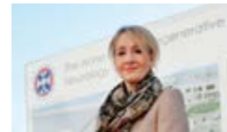
J K Rowling Celebrated author of the international bestselling Harry Potter books.