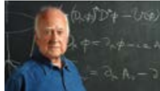
Professor Peter Higgs Emeritus Professor of Theoretical Physics and one of the Nobel Prize winners we're associated with.