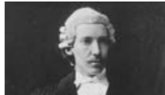
Robert Louis Stevenson Scottish novelist who wrote Treasure Island and Kidnapped .