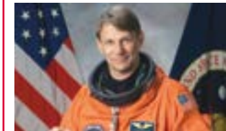
Piers Sellers Astronaut and ecologist.