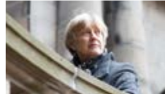
Dame Stella Rimington Popular crime writer and former MI5 Director.