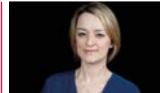
Laura Kuenssberg British journalist and the BBC's first female Political Editor.