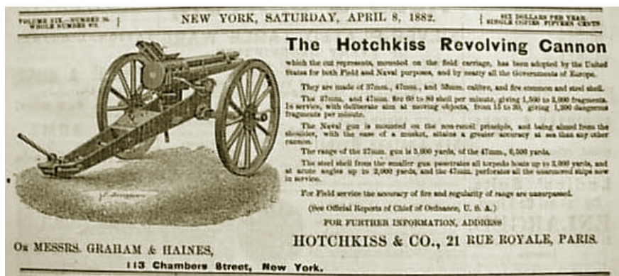
Figure 1.3. Hotchkiss Revolving Cannon

Ideologies of US settler colonialism directly informed Australian settler colonialism. South African apartheid townships, the kill-zones in what became the Philippine colony, then nation-state, the checkerboarding of Palestinian land with checkpoints, were modeled after U.S. seizures of land and containments of Indian bodies to reservations. The racial science developed in the U.S. (a settler colonial racial science) informed Hitler’s designs on racial purity (“This book is my bible” he said of Madison Grant’s The Passing of the Great Race ). The admiration is sometimes mutual, the doctors and administrators of forced sterilizations of black, Native, disabled, poor, and mostly female people - The Sterilization Act accompanied the Racial Integrity Act and the Pocohontas Exception - praised the Nazi eugenics program. Forced sterilizations became illegal in California in 1964. The management technologies of North American settler colonialism have provided the tools for internal colonialisms elsewhere.