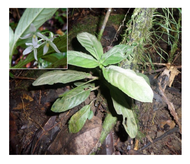
Championia reticulata : Only species recorded from the monotypic genus Championia from Sri Lanka, observed and collected from low land forests to sub montane forests with an elevation range from 100-1200 meters.