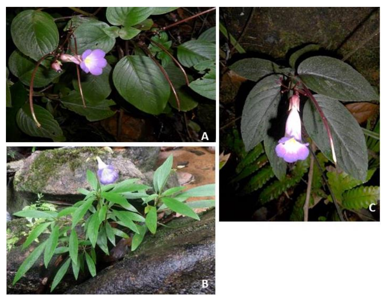
Henckelia communis morpo type 1(A), 2(B) and Henckelia angusta(C) collecting samples for population work since no discrimination in the preliminary phylogeny