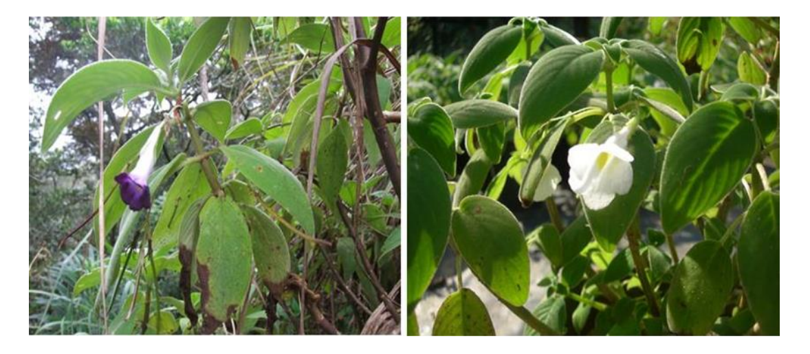
Caulescent forms of two Henckelia species; Henckelia walkerae and Henckelia walkerae var alba ( Henckelia sp.)