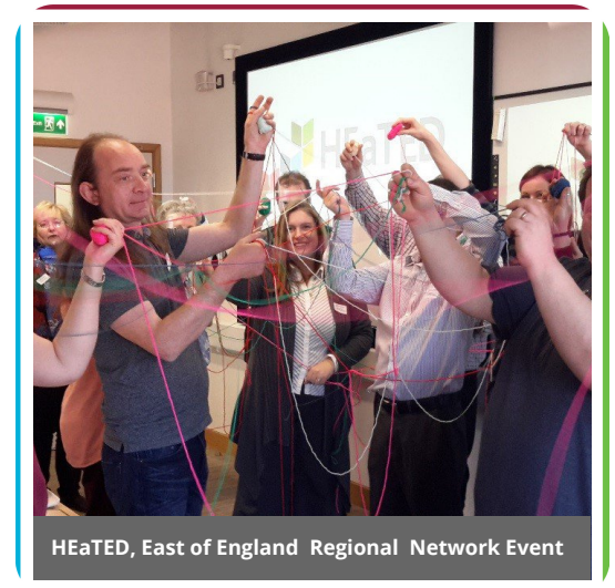
HEaTED, East of England Regional Network Event

E-Newsletters , magazines, blogs and tweets update and connect you with technicians across the UK.