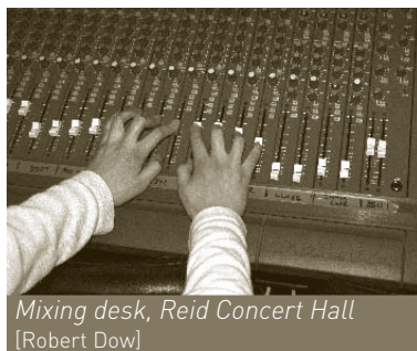
Mixing desk, Reid Concert Hall

Tuesday 7 February, 1.10pm Reid Concert Hall