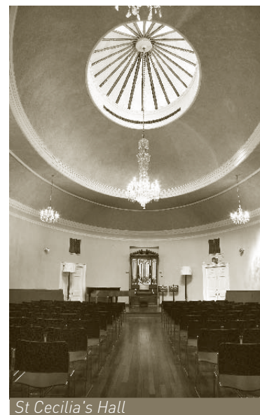
St Cecilia's Hall