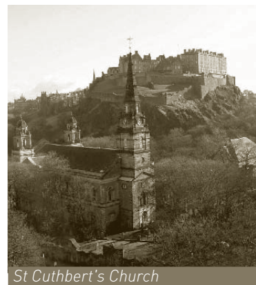
St Cuthbert's Church

TICKETS: £8.00 / £5.00 CONCESSIONS available on the door and from eums.publicity@gmail.com