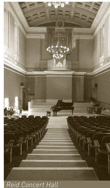
Reid Concert Hall