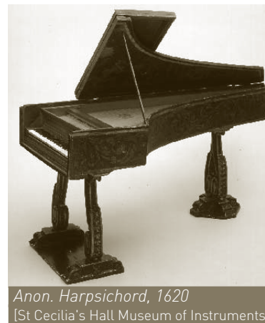
Anon. Harpsichord, 1620 [St Cecilia's Hall Museum of Instruments]

Tuesday 14 February, 1.10pm Reid Concert Hall