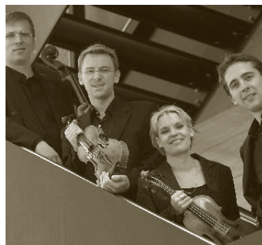
The Amar Quartet