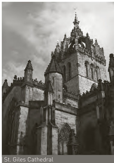
St. Giles Cathedral