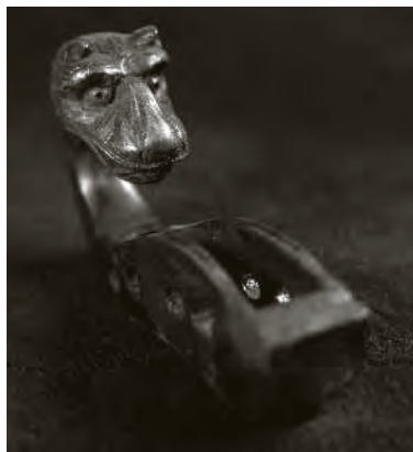
Violin finial detail Reid Concert Hall Museum of Instruments