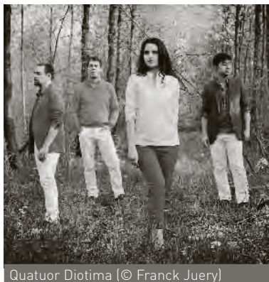
Quatuor Diotima