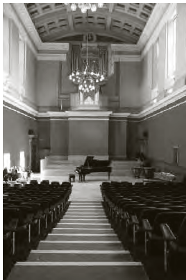
Reid Concert Hall