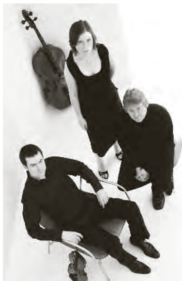
Fidelio Trio