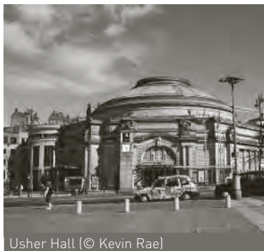
Usher Hall