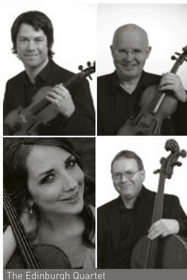
The Edinburgh Quartet