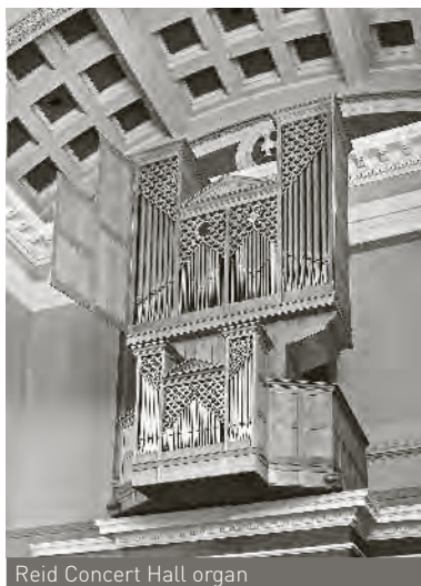
Reid Concert Hall organ